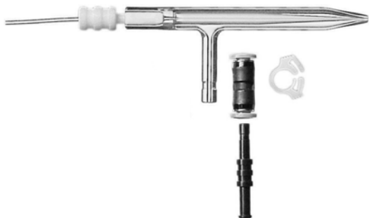
Concentric Glass Nebulizer with EzyFit Connector and EzyLok Argon Connector

A standard Conikal concentric glass nebulizer is the preferred means of vaporizing kerosene-diluted oil samples. The nebulization efficiency of kerosene is much higher than that of water, thereby introducing more sample to the plasma. If the lowest detection limits are not required, it may be beneficial to use a MicroMist low uptake concentric glass nebulizer. The lower volume of sample and solvent reaching the torch will provide a more rugged system and more robust plasma.