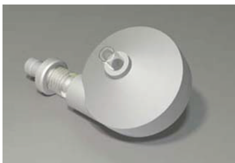
Figure 5. Encapsulated Twister Spray Chamber

The IsoMist incorporates the proven Twister cyclonic spray chamber, combining excellent sensitivity and precision with exceptionally fast washout. This spray chamber now incorporates Glass Expansion's proprietary Helix nebulizer interface which has a zero dead volume seal and provides for convenient nebulizer insertion and removal. For use with the IsoMist, the spray chamber is encapsulated with special thermally conducting material. This spray chamber is compatible with the full range of Glass Expansion nebulizers.