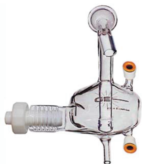
Figure 3. Jacketed Twinnabar Cyclonic Spray Chamber with Helix O'ring-Free Fitting and Auxiliary Port

Glass Expansion manufactures a low volume jacketed Twinnabar cyclonic spray chamber (20ml internal volume instead of the more standard 50ml) with a central baffle to reduce solvent transport. Although not shown in Figure 3, this spray chamber can be configured with a gravity drain to eliminate the need for pump tubing in the system. The auxiliary port can be connected to a source of oxygen such as a 20% oxygen/argon mixture. The function of the oxygen is to combust the high organic content to avoid carbon