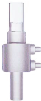
Figure 5. Fully Demountable Torch