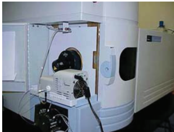
Figure 6. IsoMist on Perkin Elmer Optima

Contact enquiries@geicp.com for details on connecting the IsoMist to your specific model of ICP-MS or ICP-OES.