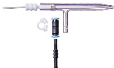
Figure 1. MicroMist Nebulizer designed to achieve a natural uptake of 0.2ml/min