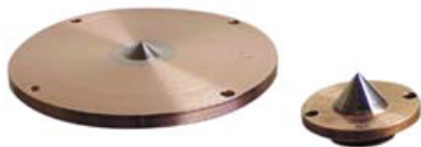
Figure 6. Platinum tipped Sampler and Skimmer Cones for the Agilent 7500

Whether adding oxygen or not, if ICP-MS is used, platinum tipped sampler and skimmer cones are preferable for this application. If not adding oxygen, the platinum cones will run hotter and keep the orifice clean longer. If adding oxygen, noble platinum cones will stand up better to the reactive environment.