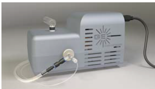
Figure 1. IsoMist

Glass Expansion is pleased to announce the release of the new IsoMist Programmable Temperature Spray Chamber, providing the benefits of a temperature-controlled ICP sample introduction system in a compact, convenient package.