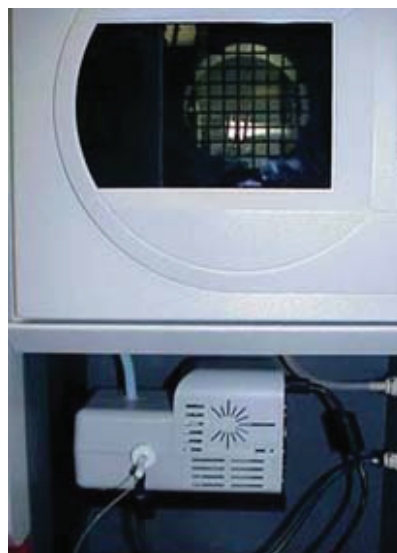
Figure 7. IsoMist on Varian Vista